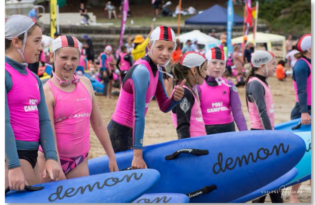
Thumbs up: U12 girls getting ready to race.

This model helps to collect important information like Working with Children Checks, one part of our club's rigorous Child Safety policy.'