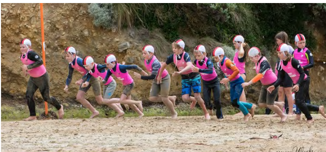
Off & racing: U10 boys' beach sprint race.

In 2023, PCSLSC invited parents (or caregivers in a family) to commit to being either a social or an active member of our club, in order for their children to be eligible for junior membership and Nippers.