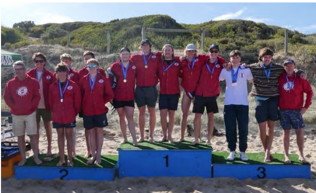
Clean sweep: PCSLSC U19 boat crews took out gold, silver, and bronze at the 2024 Victorian Titles.

The Subsonics also were the Victorian U19 boys representative crew at the interstate challenge at the ASRL Open, this is the second year in a row they have achieved this honour.