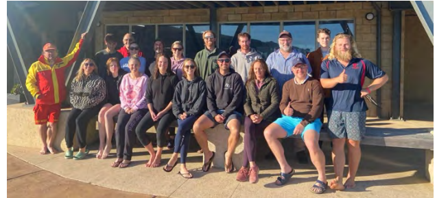
One of the many bronze groups to go through this season.