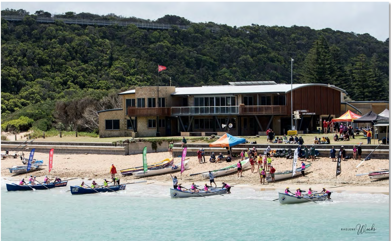
Off & racing: Victorian crews competing at the PCSLSC short course carnival in November 2023.