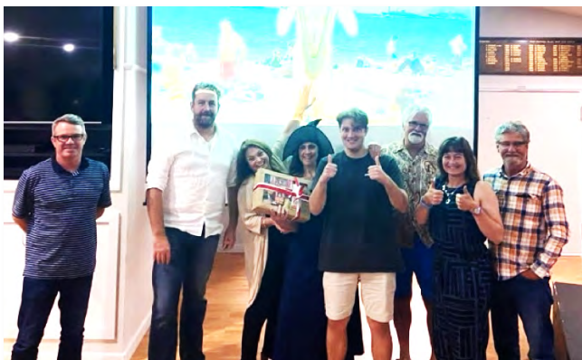
Winners are grinners: Trivia night with a Twist winning team.

determination and youthful enthusiasm, they rallied the troops on a Wednesday evening just after New Year's Eve, when the appetite for fun and a few drinks was at festive levels.