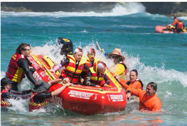
Nipper Fun Day: one of the favourite days for participants keen to try out the IRBs.