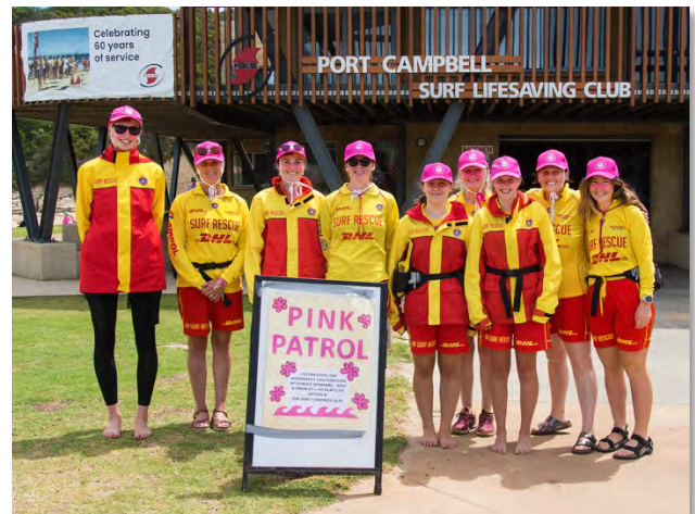
2024 Pink Patrol members.