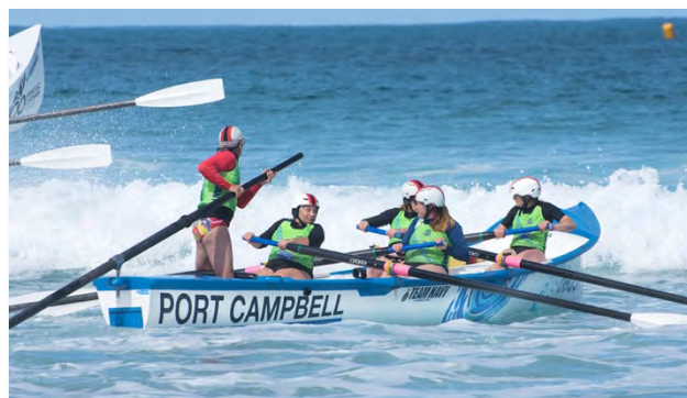
All smiles: The Kittens cleaned up in the 200 years masters.

The Kittens Masters' Women's crew had an excellent year, winning Gold at the State Masters Titles, and a bronze at the ASRL masters, both in the 200 years combined division.