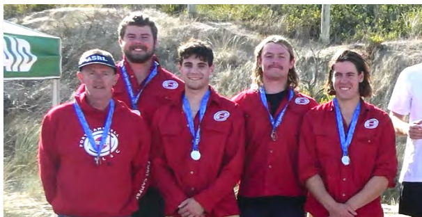
Silverware for the U23 boys, Whisky Business.

The Whiskey Business U23 boys crew had some good results during the season, with the highlight being a silver medal at the Victorian state titles at Ocean Grove.