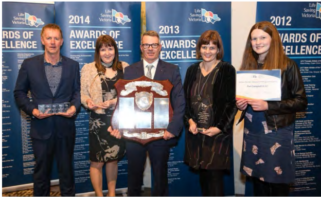
PCSLSC won LSV Club of the Year, Lifesaver of the Year and Team of the Year at the 2023 LSV Awards of Excellence.

It was an honour to be able to represent all of our hard-working members at the Life Saving Victoria (LSV) Awards of Excellence in August 2023. I wonder if the twenty young guys of the inaugural bronze squad in December 1963 could have ever imagined where the club would be 60 years on. To quote the LSV media release about the night: