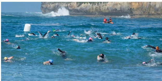
Swimmers in action at the 2024 event.