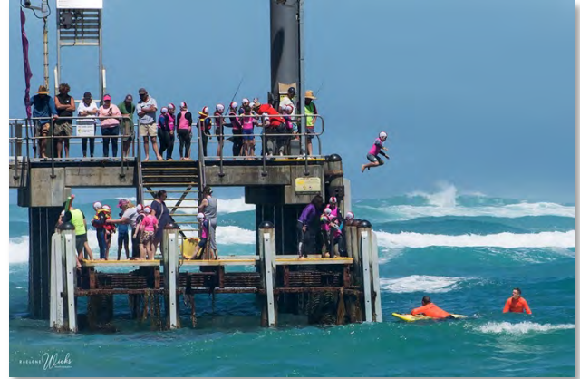
A summer highlight: swimming to and jumping off the jetty.