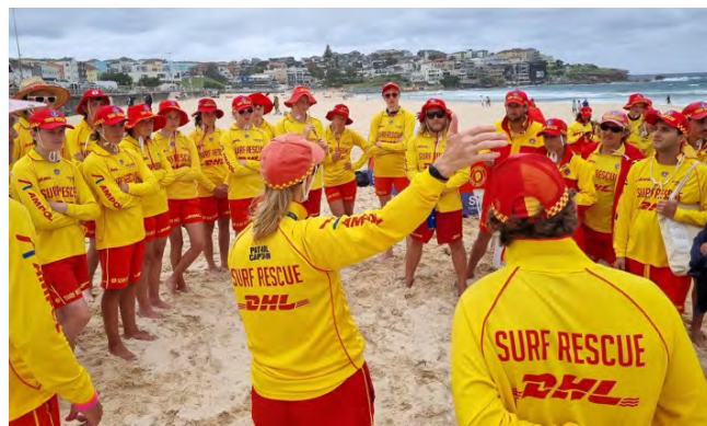
PCSLSC Bondi Camp participants in a patrol briefing with Bondi SLSC members.