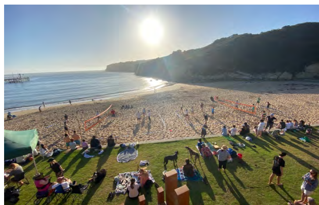
Twilight volleyball was held Friday nights in January and proved popular with locals and tourists alike!

The Barrels Bar has stepped up as a sponsor this season, making sure that volleyball enthusiasts could enjoy the game without any charge. Some of the sponsorship