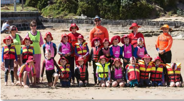
PCSLSC U8 Nippers with Age Managers and helpers.

Please take the time to read the list of contributors and if you see them, acknowledge them!