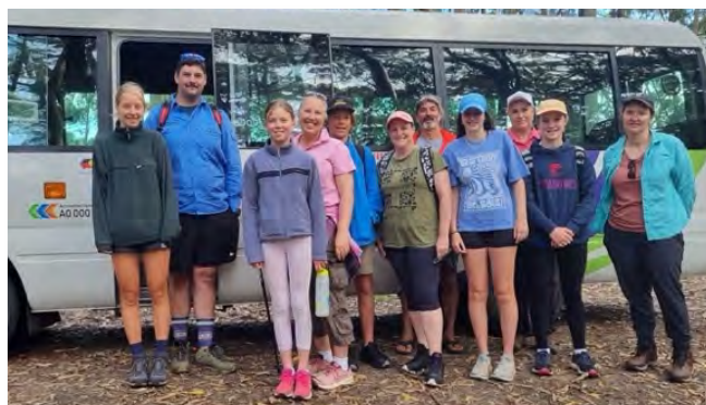
Thank you to Popes Buslines for supporting the GOW Day 2024.