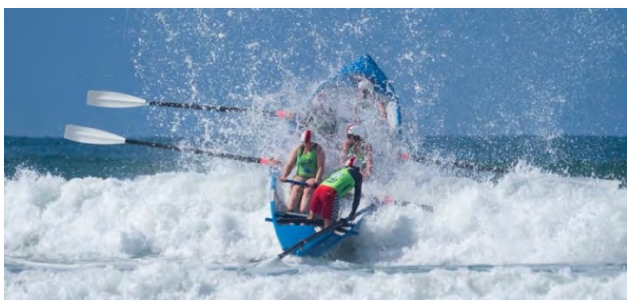
The Fireballs punching through one at the Ocean Grove carnival in December.

The Fireballs U23 girls rowed well but were unlucky a few times. They improved as the season went on and became adept at righting the boat after their sweep had rolled it. They should expect better results next season.