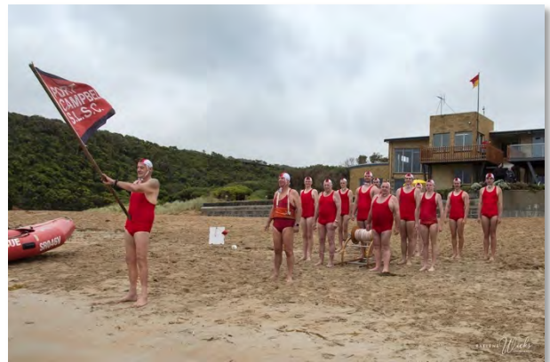
Celebrating PCSLSC's 60 th anniversary with a march past.