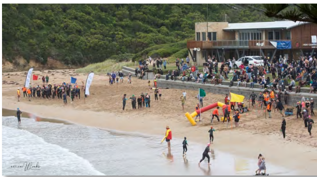
Record registrations were achieved at the 2024 swim.

The Jon McLeod Memorial Swim was held at Port Campbell in what can only be called very challenging conditions! Several swimmers required assistance as the swell increased and conditions became increasingly difficult.