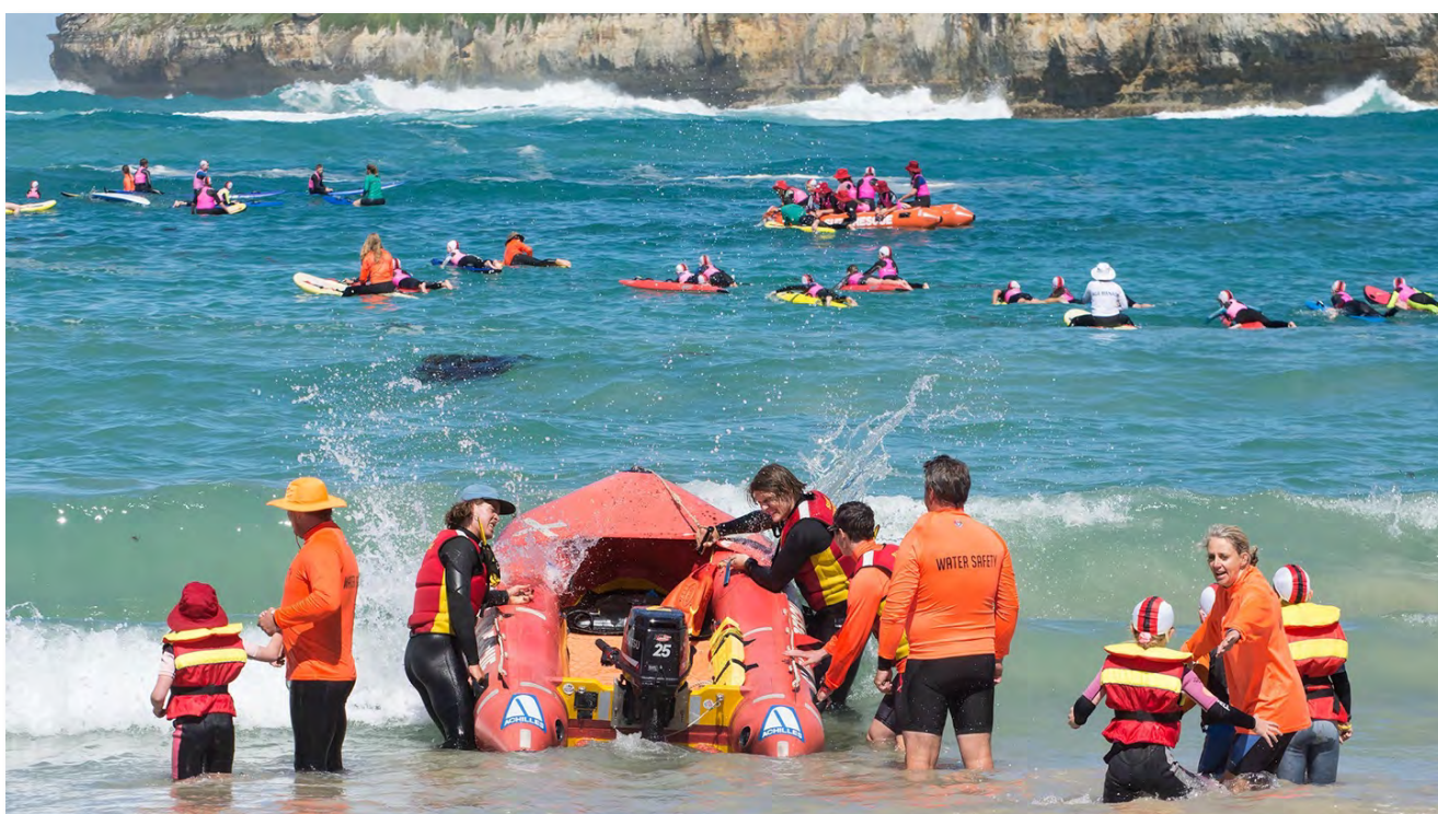
Nipper fun day 2024.