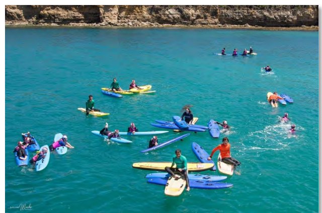
Perfect conditions for a paddle.