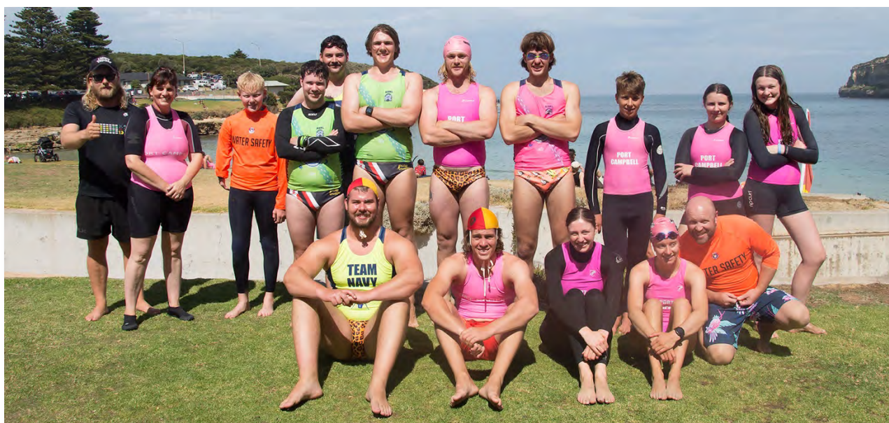
You have to be in it to win it: some of our 2023/24 club championships participants.

Well done to all competitors who participated in this year's Club Championships. This year clubbies were put through a timed run, swim, and board event in calm and sunny conditions.