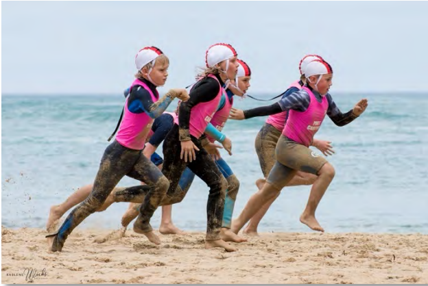
Tight finish: U9 boys' beach sprint.