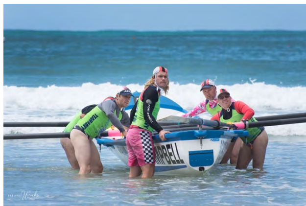
The Shipwrecks: our reserve & masters men dusted off the cobwebs to row at ASRL Lorne.

The ASRL Open at Lorne saw two new crews get their act together for the weekend. The Shipwrecks rowed in the 200 years' combined master's division and finished fourth in the final. The Remixed Nuts rowed reserve grade and, despite very little training, put up a good performance.