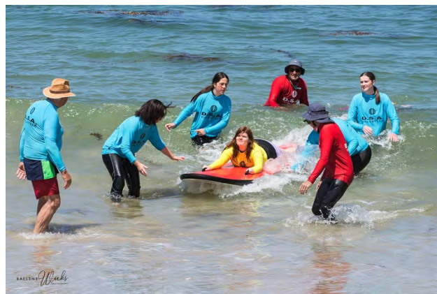
Disabled surfing at the accessible beach day.

Seven participants braved the chilly waters of the bay for the chance to catch a wave under the experienced hand of the Disabled Surfers Association Great South Coast Victoria (DSAGSCV). Participants ranged in age and experience, from the young to the old, and some first-time surfers to others who were up to their fourth time on the boards. Another seven participants came along for the beach wheelchair walks, which went around to the suspension bridge and back, via the river and a sensory station.