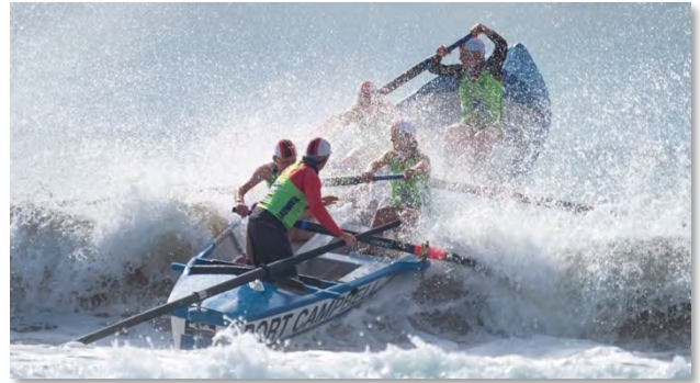
A strong debut for the Crays (U19 boys).

The crews also made a clean sweep of the medals at the Victorian State Titles, with the Stingrays winning gold, the Crays silver and the Subsonics bronze.