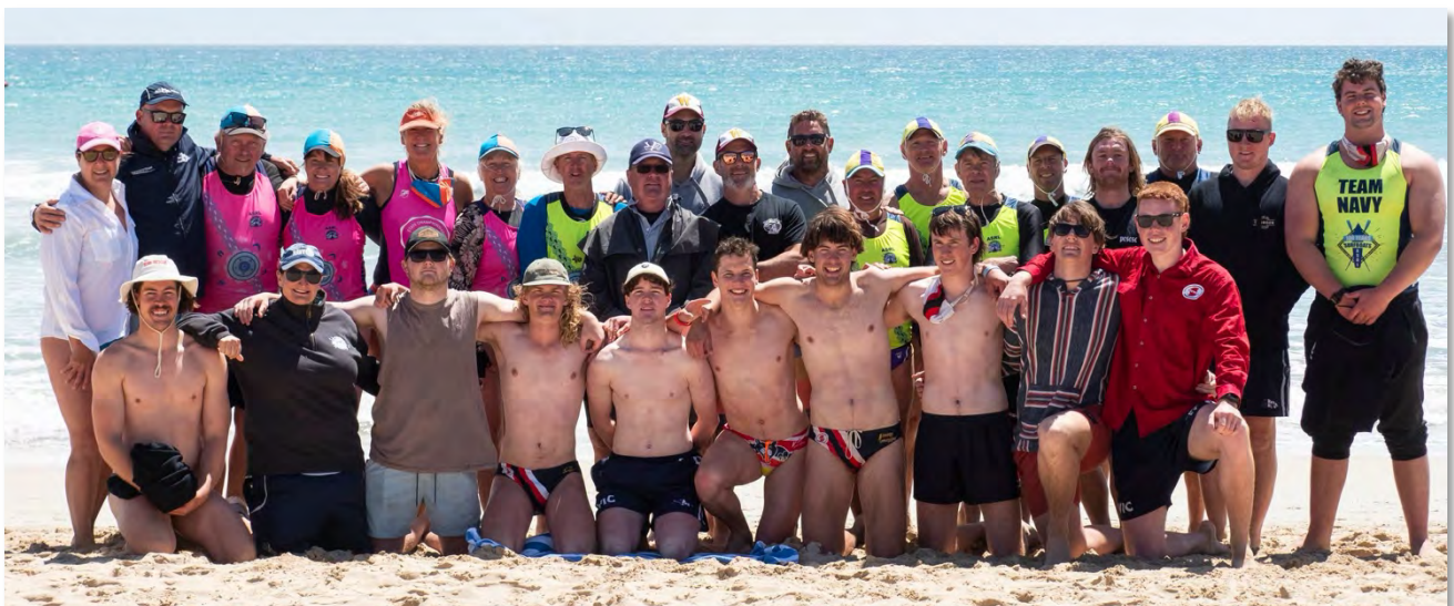
Victorian crews teaming up for a group photo at the Robe carnival in South Australia in December.