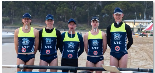
Victorian U19 Boys State Team: The Subsonics.