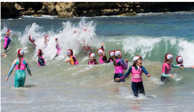
Surf's up: Nippers enjoying the waves.