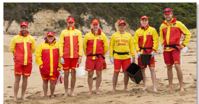
2024 Green Patrol on beach clean-up duties.