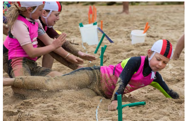
Tough competition in the U9 girls' flags.

Building positive connections with the club more widely was another goal for compulsory family memberships. For example, Nippers parents who are social members of our club are more likely to stay and enjoy a drink on the deck, and more likely to be familiar with SLSA and LSV online platforms, such as the Member's Area and Club Gateway portals.