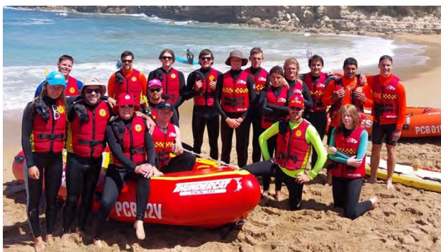
The club successfully added 10 new IRB drivers and 10 new IRB crew members over the season.

As we head towards a new summer, we will have more opportunities to undertake training online over the cooler months, more details will be available via our social media pages soon.