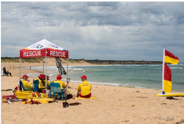
PCSLSC members patrolling Peterborough Main Beach.

Social media is a pivotal platform for our club, the interaction with people from outside have increased a lot this past year. The average 'Reach' for most Facebook post's is 834 people with our highest being 2,855 people on Facebook. Here are some of my favourite moments from this past year: