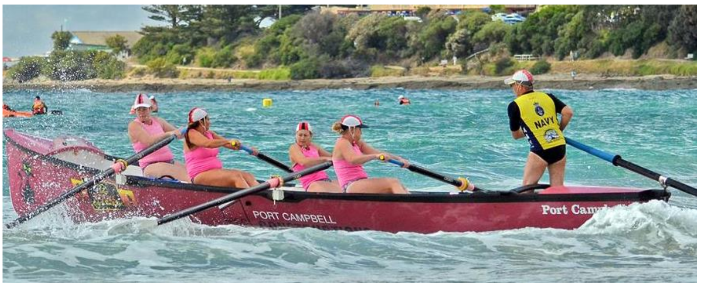
Reserve Grade Women: Siver Medalists 180 division, Victorian Masters, semi-finalists Vics.

The U19 girls had a great year, winning at Portland, Anglesea and Ocean Grove carnivals., making the State team as the U19 girls crew for Victoria, and coming away with a silver medal at the state title.