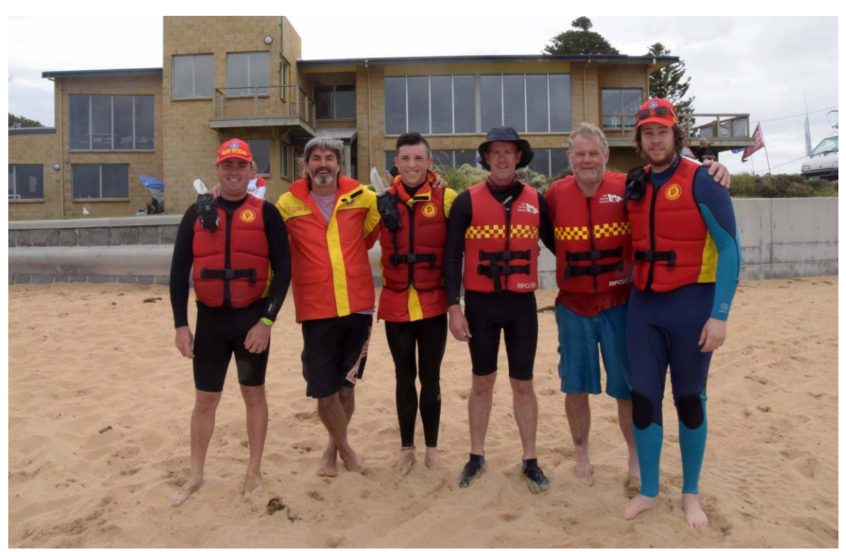
Some of our IRB Drivers and crew

And the many other individuals, families, groups and businesses that have supported us throughout the year