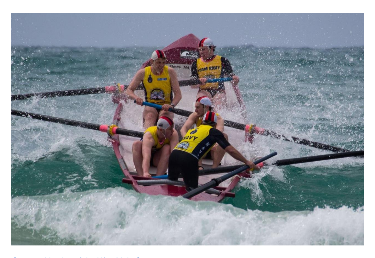
One combination of the U/19 Male Crew: