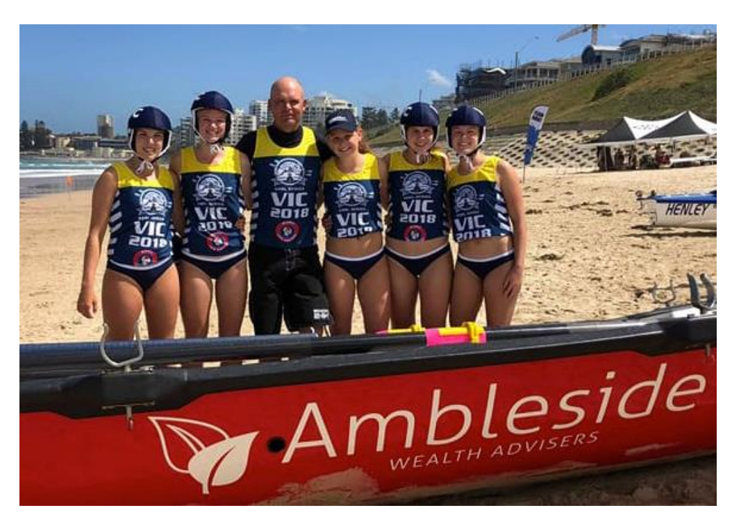
U/19 Female Crew: 2018 Victorian Representatives for ASRL Championships, Elouera; Silver Medalists, Victorian Championships, Apollo Bay.

It was a grand season all round for the Port Campbell boaties. We kicked off all the way back in October when 7 junior members and myself travelled to Anglesea for the junior development camp. It was great to get feedback from very experienced sweeps and coaches and spend time just concentrating on rowing and catching some nice waves at Point Roadknight.