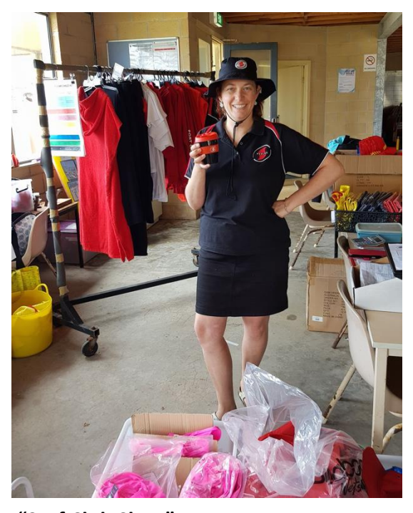
"Surf Club Shop"

It has once again been my pleasure to have been the apparel officer over the past year. It has been interesting to find out more about the club and, make some changes to the club's apparel.