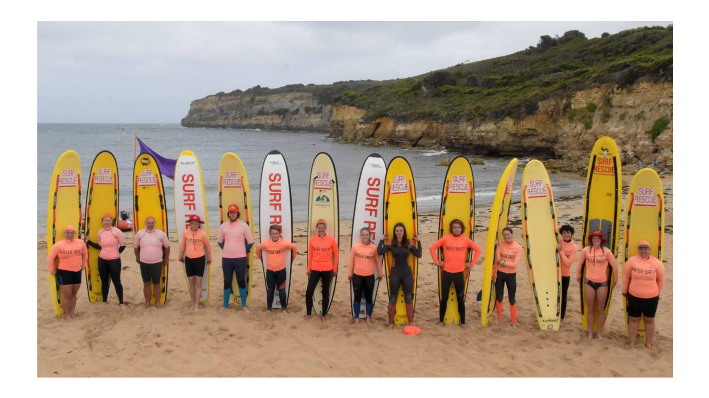
Water Safety Officers for the '12 Apostles Plunge' Swim