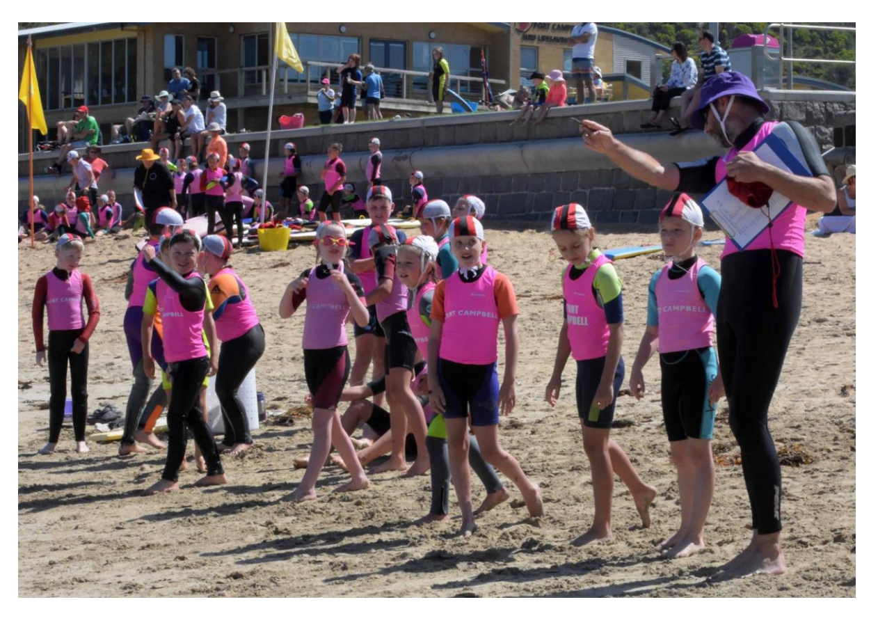
Getting ready for a Nipper Wading Race

Thanks also to everybody who volunteered with water safety during the season. Volunteers range from those who turn up every week to those who help out when they can.