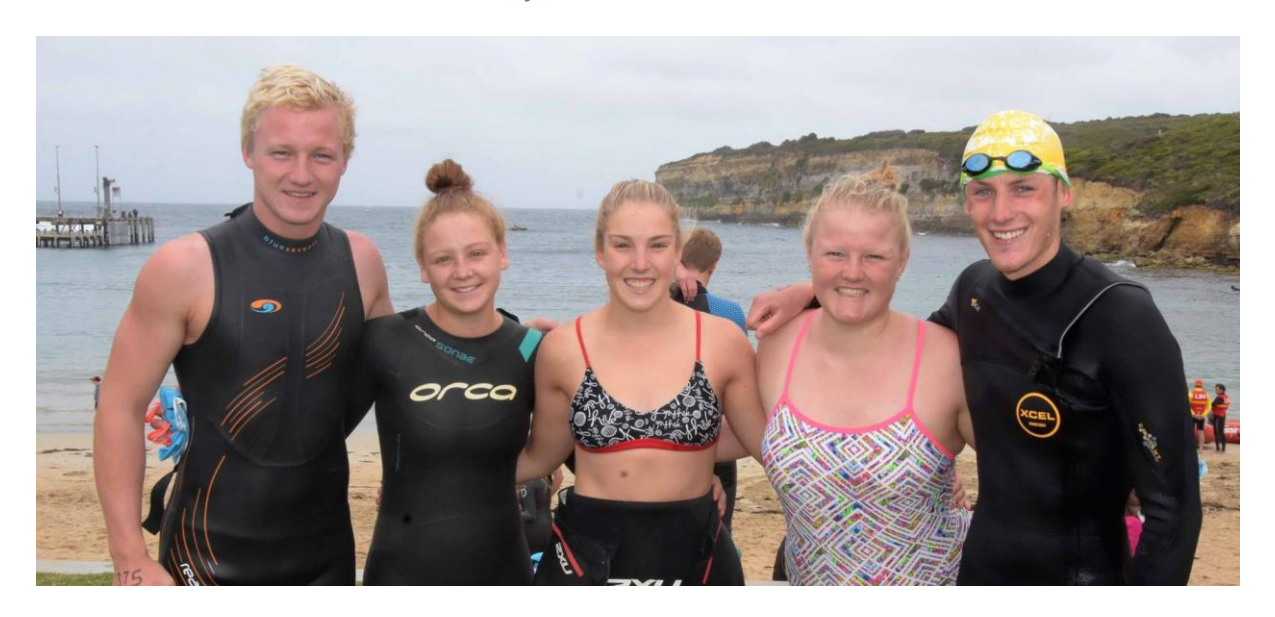
U/18 members before the swim