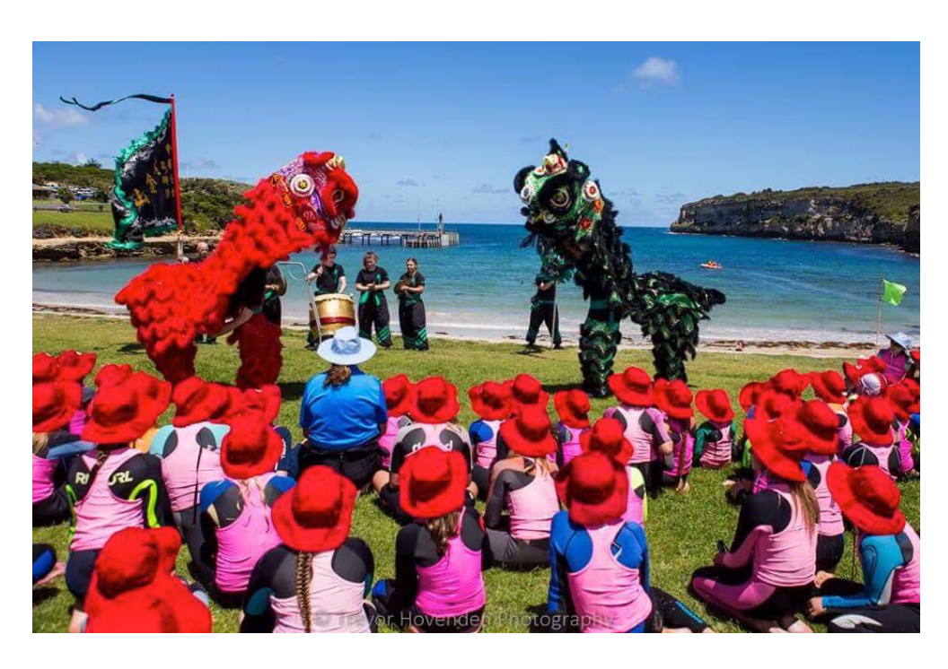
Lunar New Year celebrations at Nippers