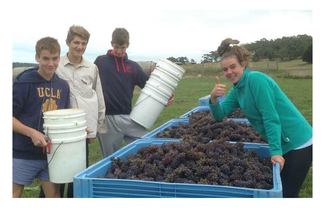
Grape picking Fundraiser at Newton's Ridge Winery